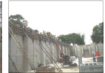
Structural Concrete UMKC Miller Nichols Library Addition, Kansas City, MO

State of Kansas Murray & Sons Construction Co., Inc. The Ebert Mayo Design Group AGA Consulting, Inc. CECO Concrete Construction Midwest Concrete Materials