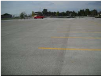
Pervious Concrete Oregon Trail Parking Lot Olathe, KS

City of Independence, MO George Butler Associates Emery Sapp & Sons, Inc. Lafarge A & C