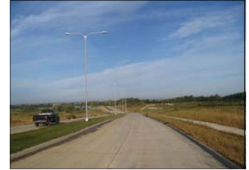
Municipal Paving 39th Street Improvements Independence, MO

Evangel Temple Emery Sapp & Sons, Inc. Lafarge A & C