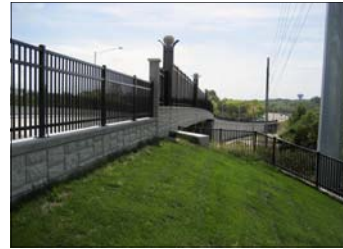
Bridge MoDot Pryor Road Bridge Lee's Summit, MO