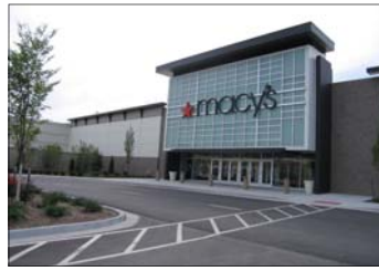
Site Cast Tilt-Up Macy's Summit Fair Lee's Summit, MO

City of Independence, MO Benham Companies J.E. Dunn Construction Co., Inc. Sink Combs Dethlefs Martin/Martin, Inc. Lafarge A & C