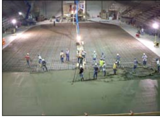
Commercial Floors Independence Events Center Independence, MO

City of Independence, MO Benham Companies J.E. Dunn Construction Co., Inc. Sink Combs Dethlefs Martin/Martin, Inc. Lafarge A & C