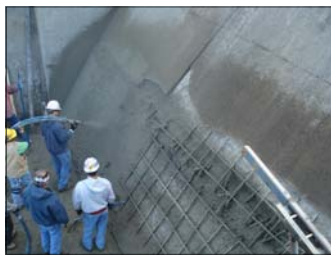
Concrete Restoration Lake Olathe Dam Stabilization Olathe, KS

Univ. of Missouri, Kansas City The Whiting-Turner Contracting Co. Walter P. Moore PGAV Architects John Rohrer Contracting Co., Inc. Lafarge A & C