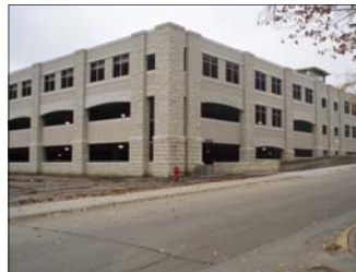
Parking Garage K-State Parking Garage Manhattan, KS

City of Lee's Summit, MO Missouri Dept. of Transportation Pyramid Contractors, Inc. Stark Construction Fordyce Concrete Company