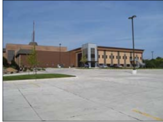
Concrete Parking Lot Evangel Temple Kansas City, MO

Macy's Dept. Stores Inc. S. M. Wilson & Co. The Durrant Group Lithko Contracting, Inc. Geiger Ready-Mix Co., Inc.