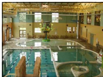
Decorative Commercial Olathe Community Center Olathe, KS

City of Olathe, KS Kansas Dept. of Transportation J.M. Fahey Construction Co. Geiger Ready-Mix Co., Inc.