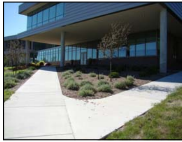
Multiple Cast-in-Place Uses Bioscience & Technology Business Center Lawrence, KS

Sam's Club #6247 Lottman Carpenter Construction Crane Construction Geiger Ready-Mix Co., Inc.