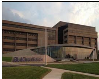
Low Rise Black & Veatch Innovation Pavilion Overland Park, KS

United Govt. of Wyandotte Co. John Rohrer Contracting Co., Inc. Fordyce Concrete Co., Inc.