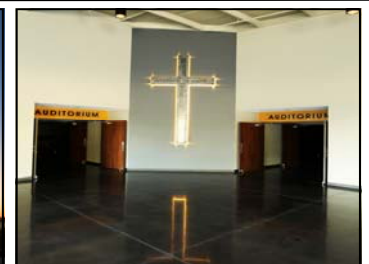
Polished Concrete Church of the Harvest Olathe, KS

Block Real Estate Services BK Properties Summit Concrete Quicksilver Readymix LLC