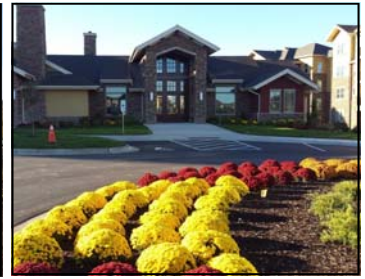
Multi Family Water Crest Apartments at City Center Lenexa, KS

DeSoto Residence ACS Concrete Construction Quicksilver Readymix LLC