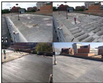
Restoration Parking Facility C - 7th & Ann Kansas City, KS

Block Real Estate Services Bedrock Concrete LLC Downey Foundation Inc. Geiger Ready-Mix Co., Inc.