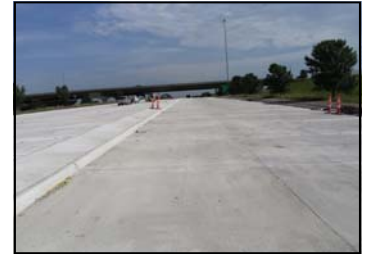
Paving DOT 7 Highway & 151st Street Olathe, KS

Overland Park Family ACS Concrete Construction Quicksilver Readymix LLC