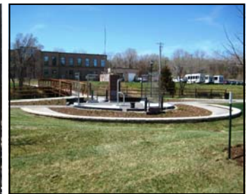
Monuments Sugar Creek 9-11 Memorial Sugar Creek, MO

51 Main Lithko Contracting, Inc. OPUS Design Build, LLC OPUS AE Group, Inc. Penny's Concrete, Inc.