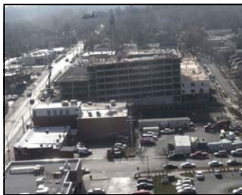
Parking Garage 51 Main Kansas City, MO

Black & Veatch J.E. Dunn Construction Co., Inc. Talon Concrete & Aggregates LLC