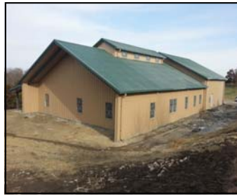
Sustainable/Green DeSoto Residence DeSoto, KS

Kansas University Bottorff Construction Mar Lan Construction Penny's Concrete, Inc.