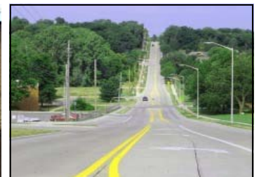
Municipal Paving 79th St. - Pflumm to Lackman Lenexa, KS

Seasonal Concepts ACS Concrete Construction Quicksilver Readymix LLC