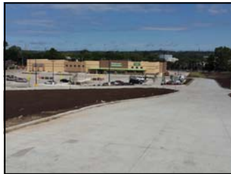
Concrete Parking Lot Wal-Mart Neighborhood Market Kansas City, KS

Wal-Mart Neighborhood Market #6172 Argentine Retail Developers, LLC Crossland Construction Co., Inc. Geiger Ready-Mix Co., Inc.