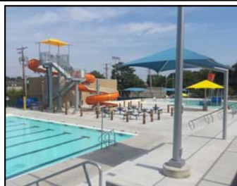
Swimming Pools Mission Aquatic Center Mission, KS

City of Lenexa, KS Emery Sapp & Sons, Inc. Geiger Ready-Mix Co., Inc. Talon Concrete & Aggregates LLC