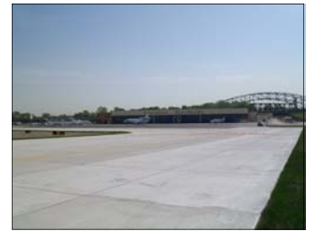
Airport Paving Wheeler Airport Runway 1/19 Safety Area

City of Harrisonville, MO David E. Ross Construction Burns & McDonnell Geiger Ready-Mix Co., Inc. KTI Technologies