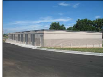
Structural Aesthetics Cerner LS-V Improvements

City of Overland Park, KS Kings Construction Co., Inc. Permanent Paving, Inc. Haake Foundations, Inc. DLR Group CHA Sports LLP Geiger Ready-Mix Co., Inc.