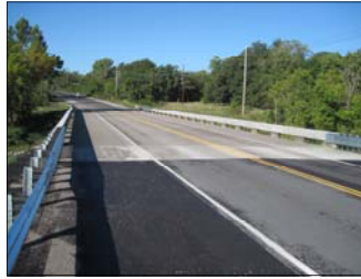
Concrete Restoration Old Hwy 56 Bridge Rehabilitation

Cerner Corporation McCown Gordon Construction, LLC BURR Computer Environments, Inc. John Rohrer Contracting Co. Bob D. Campbell & Co. Herman A. Scharhag Fordyce Concrete Co., Inc. PSI, Inc.