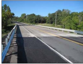
Concrete Restoration Old Hwy 56 Bridge Rehabilitation

Cerner Corporation McCown Gordon Construction, LLC BURR Computer Environments, Inc. John Rohrer Contracting Co. Bob D. Campbell & Co. Herman A. Scharhag Fordyce Concrete Co., Inc. PSI, Inc.