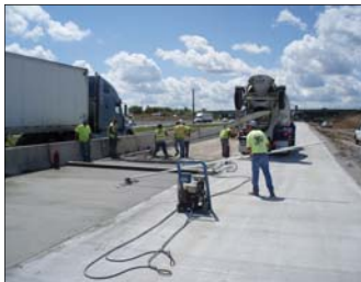
Paving DOT Hwy 350 & I-470 Paving & Bridges

Bradken Free Country Design & Construction, Inc. Bottorff Construction Ellison-Auxier Architects, Inc. Geiger Ready-Mix Co., Inc. Alpha-Omega Geotech, Inc.