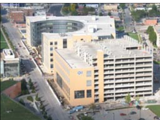
Parking Garages Wellmark Parking Garage

City of Prairie Village, KS Bryan-Ohlmeier Construction Co. Inc. Coreslab Structures (MO) Inc. GBA Architects & Engineers Geiger Ready-Mix Co., Inc. PSI, Inc.