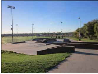
Recreation Project Overland Park, KS Skate Park

City of Overland Park, KS Kings Construction Co., Inc. Permanent Paving, Inc. Haake Foundations, Inc. DLR Group CHA Sports LLP Geiger Ready-Mix Co., Inc.