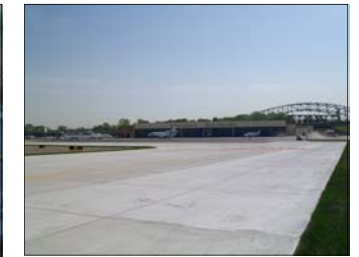
Airport Paving Wheeler Airport Runway 1/19 Safety Area

City of Harrisonville, MO David E. Ross Construction Burns & McDonnell Geiger Ready-Mix Co., Inc. KTI Technologies