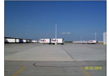
Parking Lots Federal Express

City of Olathe, KS Bryan-Ohlmeier Construction, Inc. GBA Architects & Engineers Geiger Ready-Mix Co., Inc.