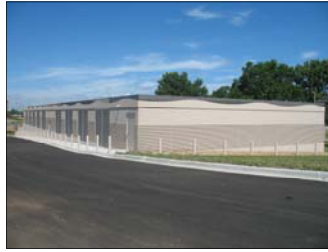
Structural Aesthetics Cerner LS-V Improvements

City of Overland Park, KS Kings Construction Co., Inc. Permanent Paving, Inc. Haake Foundations, Inc. DLR Group CHA Sports LLP Geiger Ready-Mix Co., Inc.