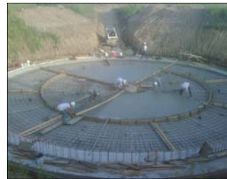
Wastewater Treatment Harrisonville Wastewater Treatment Expansion

MoDOT Pyramid Contractors, Inc. Realm Construction, Inc. Fordyce Concrete Co., Inc. Hunt Martin Materials, LLC