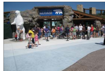
Overall Concrete Award Kansas City Zoo Polar Bear Exhibit

Wellmark Blue Cross Blue Shield The Weitz Construction Company CECO Concrete Construction, LLC HOK CTI Ready Mix