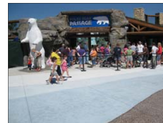
Overall Concrete Award Kansas City Zoo Polar Bear Exhibit

Wellmark Blue Cross Blue Shield The Weitz Construction Company CECO Concrete Construction, LLC HOK CTI Ready Mix