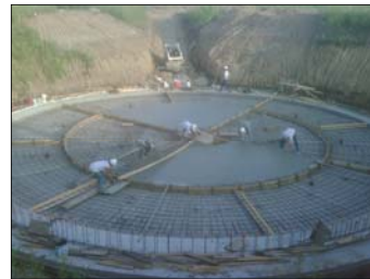
Wastewater Treatment Harrisonville Wastewater Treatment Expansion

MoDOT Pyramid Contractors, Inc. Realm Construction, Inc. Fordyce Concrete Co., Inc. Hunt Martin Materials, LLC