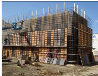
Concrete Building Bradken Gamma Ray Building

Federal Express Corporation Musselman & Hall Contractors Lafarge A & C