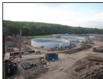
Water Treatment Plant Cedar Creek WWTP Phase 1 Expansion Olathe, KS

U.S. Dept. of Veteran Affairs Zieson Construction Co. Bottorff Construction, Inc. GBA Architects Engineers Geiger Ready-Mix Co., Inc. Terracon, Inc.