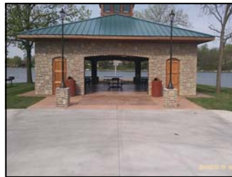
Parks & Recreation Sea Point Park Weatherby Lake, MO

U.S. Army Corps of Engineers J.E. Dunn Construction Co. KH Engineering Group Gastinger Walker Harden Architects Penny's Concrete, Inc. Kleinfelder