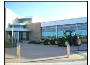
Sustainable/Green John Deere Sales Facility Olathe, KS

City of Weatherby Lake, MO Ernst Brothers Construction, Inc. Geiger Ready-Mix Co., Inc.