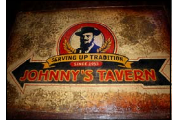
Decorative Commercial Johnny's Tavern Overland Park, KS

Earp Meat Company ARCO National Construction Co. Lithko Contracting, Inc. PMA Engineering Finkle | Williams Architecture Penny's Concrete, Inc. Olsson Associates