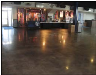
Polished Concrete LIVESTRONG Sporting Park Kansas City, KS

Johnny's Tavern Artistic Concrete Surfaces AMAI Architecture Geiger Ready-Mix Co., Inc. Decorative Concrete Supply, Inc.