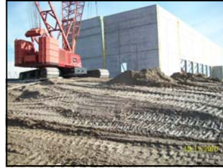
Site Cast Tilt-up EARP Distribution Center Edwardsville, KS

Children's Mercy Hospital J.E. Dunn Construction Co. Bob D. Campbell & Co., Inc. HMN Architects, Inc. Fordyce Concrete Co., Inc. Kaw Valley Engineering, Inc.