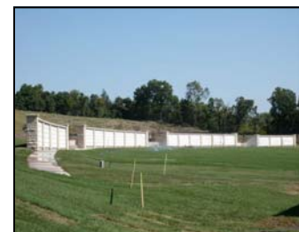
Specialty Concrete Leavenworth National Cemetery Expansion Leavenworth, KS

Kansas BioScience Authority Excel Constructors, Inc. Lithko Contracting, Inc. Schlagel & Associates P.A. PGAV Architects Penny's Concrete, Inc. Kleinfelder ACI Concrete Placement LLC