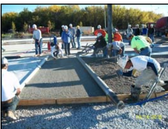
Pervious Paving Kansas BioScience Venture Accelerator Olathe, KS

Deere & Company The Weitz Company George J. Shaw Construction Co. Intec Construction Co. Olsson Associates Holland Basham Architects Lafarge A & C ACI Concrete Placement LLC