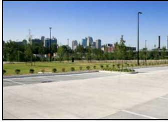
Municipal Paving Front Street Road Improvements Kansas City, MO

City of Kansas City, MO Emery Sapp & Sons, Inc. HNTB Corp. Lafarge A & C