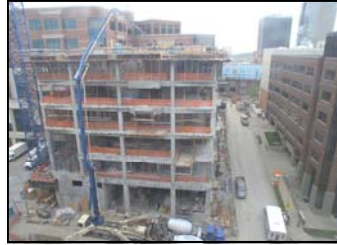
High Rise Children's Hospital East Tower Kansas City, MO

City of Kansas City, MO Emery Sapp & Sons, Inc. HNTB Corp. Lafarge A & C