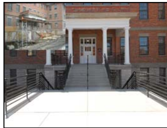
Concrete Restoration Building 465, Ft. Leavenworth Leavenworth, KS

On Goal LLC Turner Construction Company Leavcon II, Inc. Admire Concrete & Stone Solutions Thorton & Thomasetti Group Populous Lafarge A & C Professional Service Industries, Inc.