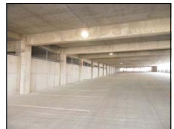
Parking Garage East Village Parking Garage Kansas City, MO

U.S. Army Corp of Engineers Leavcon II, Inc. PCL Construction Services Yaeger Architecture, Inc. Merrick & Company KTI Geiger Ready-Mix Co., Inc.