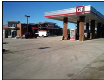
Concrete Parking Lots QuikTrip #202 Kansas City, MO

QuikTrip Corp. Rothwell Construction Goodart Construction Co. Geiger Ready-Mix Co., Inc.