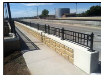
Bridge 159 th Street Bridge Overland Park, KS

City of Kansas City, MO Parks & Rec. The Pool Company Barsto Construction G.M.R. Concrete & Construction, Inc. Waters Edge Aquatic Design Trek Design Group Geiger Ready-Mix Co., Inc.