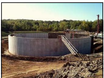
Wastewater Treatment Plant Fishing River Plant Kansas City, MO

GF Properties J.E. Dunn Construction Co. GBA Architects, Engineers Terracon Consultants, Inc. Lafarge A & C