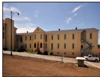
Concrete Renovation Fort Leavenworth Historical Buildings 466/467 Leavenworth, KS