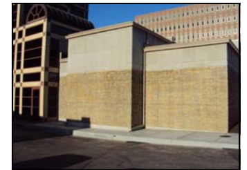
Heavy Weight Concrete Saint Luke's Linear Accelerator Kansas City, MO

Todd Bolender Center for Dance J.E. Dunn Construction Co. Structural Engineering Associates Lafarge A & C