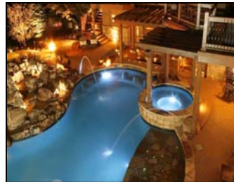
Residential Decorative Private Residence Overland Park, KS

QuikTrip Corp. Rothwell Construction Goodart Construction Co. Geiger Ready-Mix Co., Inc.