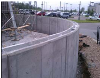
Arena/Sports Worth Harley Davidson Kansas City, MO

Hendrick Automotive Group Lithko Contracting, Inc. Slaggie Architects, Inc. PMA Engineering CFS Engineers Needham & Associates, Inc. Penny's Concrete, Inc.