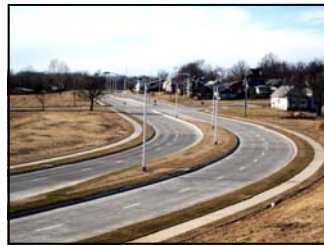
Municipal Paving Parallel Parkway, 5 th to 9 th St. Kansas City, KS

Jo. Co. Community College Artistic Concrete Surfaces Studio 804_12 Fordyce Concrete Co., Inc.