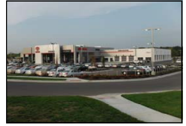
Site Cast Tilt-Up Superior Toyota Merriam Pointe Merriam, KS

Missouri Dept. of Transportation Emery Sapp & Sons, Inc. GBA Architects, Engineers Kleinfelder Fordyce Concrete Co., Inc.