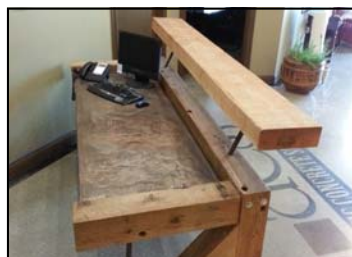
Concrete Countertops Custom Desktop Olathe, KS

City of Kansas City, MO Foley Company Burns & McDonnell Trekk Design Group LLC TSI Engineering, Inc. Geiger Ready-Mix Co., Inc.