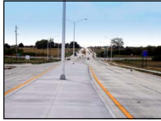
Paving DOT MO Hwy 150 Horridge Rd. to Market Street Lee's Summit, MO