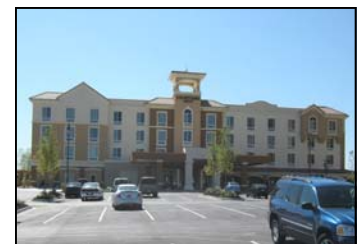
Low-Rise Courtyard by Marriott, Briarcliff Kansas City, MO

City of Overland Park, KS Pyramid Contractors HNTB Kaw Valley Engineering Fordyce Concrete Co., Inc.