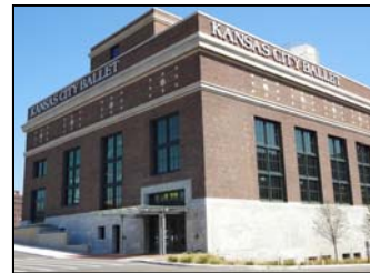
Concrete Restoration Todd Bolender Center for Dance Kansas City, MO

Unified Govt. of Wyandotte Co. Kansas Heavy Construction, LLC Delich, Roth and Goodwillie, P.A. Geiger Ready-Mix Co., Inc.