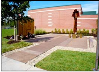
Decorative Commercial 9-11 Memorial Overland Park, KS