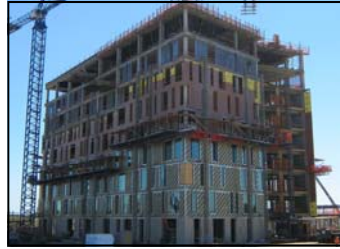
High Rise Cerner West Building Kansas City, KS