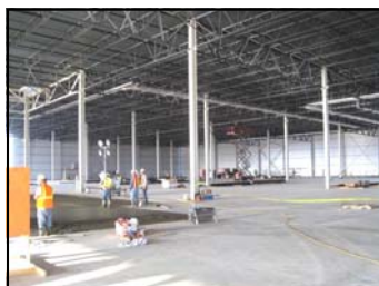
Commercial Floors Ford Stamping Plant Claycomo, MO

Artistic Concrete Surfaces Decorative Concrete Supply, Inc.