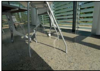
Polished Concrete Galileo's Pavilion, JCCC Overland Park, KS

Murphy Family Permanent Paving, Inc. Geiger Ready-Mix Co., Inc.